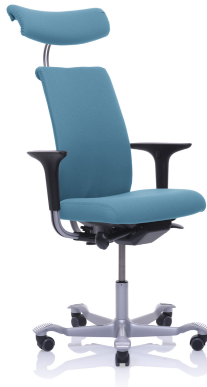
Design: Peter Opsvik. Patent- and design protected.